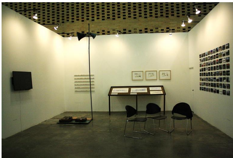
Fig. 5. Looking through Something that Seems Oneself on exhibit.

My day-to-day job has consisted in collaborating with artists that produce works with diverse characteristics. Choosing materials and developing different preservation strategies is a great responsibility, but also an amazing chance to keep learning. Conservation decisions for new artworks with non-traditional materials and features are not simple and cannot always be guided only by traditional conservation principles and guidelines. It is important to consider the artists' opinions and the audience for the work.