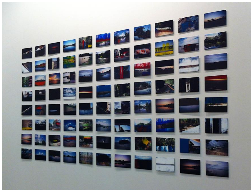
Fig. 4. The painted photographs on exhibit after being mounted to the rigid secondary supports.

The final decision regarding the mounting system was made taking the advantages and disadvantages of each proposal in to account. It was decided that the eighty-eight painted photographs would be secured to the aluminum supports. Since adopting the new exhibition system, the work has been displayed in two different locations: an art fair in Bogotá, Colombia in November 2014 and in Mexico City in February 2015. It is expected that the private or public institution that ultimately purchases the artwork will provide appropriate storage facilities and exhibition conditions.