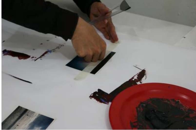
Fig. 1. Artist's intervention upon the photographs

2. Creation. Felipe Ortega's concept was an exploration of the "possibility to generate an image-now, an image that comes from a story and has a story" (Ortega, 2015). Once the concept was defined, the photographic images were selected and printed. Felipe Ortega then altered the images, playing with time and observation through color and the layering of acrylic paint films (fig. 1). This intervention established the unity of the painted photograph.