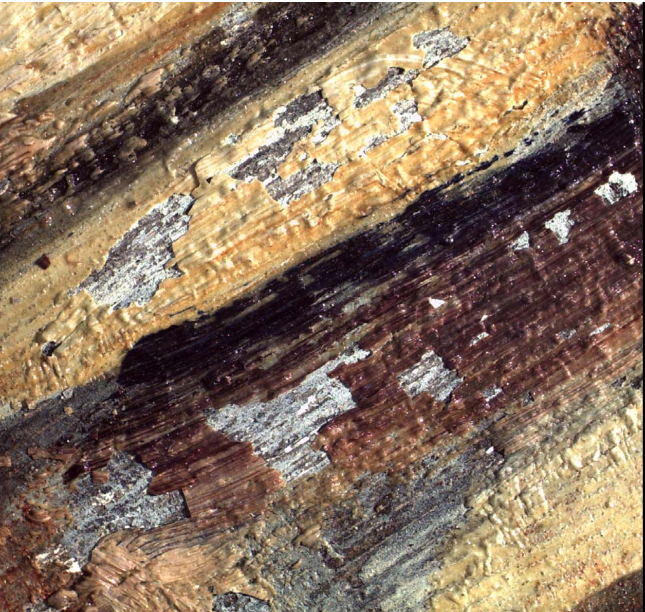
Binder before ageing